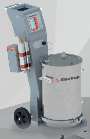
E-COAT MASTER PH-D