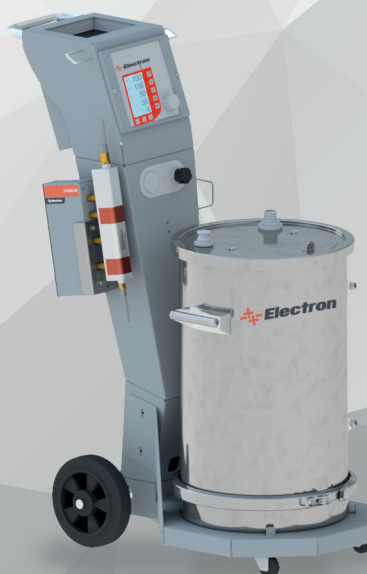
E-COAT MASTER PH-S